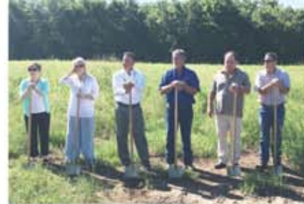
Breaking ground for Coburn's new showroom and warehouse facility.

development. The $1.5 million dollar commercial development would help the company to expand its services to the regional market and create approximately 50 new jobs in Bossier.