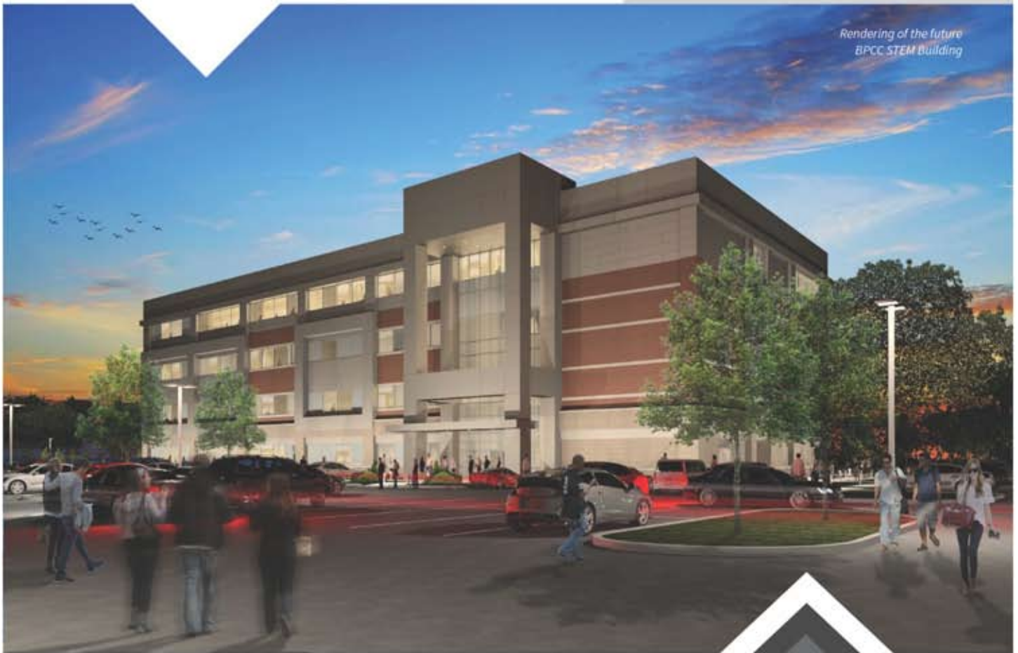
Rendering of the future BPCC STEM Building