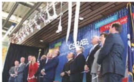
Governor Edwards join local dignitaries and CSRA officials at the ribbon cutting.

Although the proposed Customer Engagement Center had an existing company base here in the area, another community was being considered for the location making this a competitive process. The GBEDF was able to respond in a short time frame by identifying the client's needs and providing an efficient process of site selection for commercial development to help the company launch in its desired time frame. The GBEDF also helped to address the company's workforce needs. The result of our dedication and flexibility to meet the client's needs helped us to expand the Bossier job market and add 300 new employees to the area all while reviving a vacant office building near Downtown Bossier.